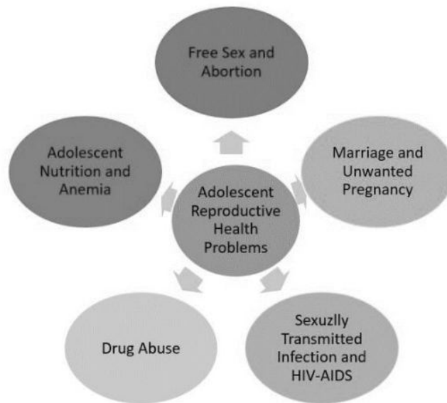
Figure 1: Adolescent reproductive health problem