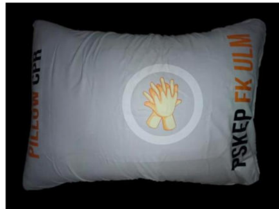
Figure 3: Foam pillow

cardiopulmonary resuscitation (C) - CPR) and hand placement on a foam pillow. Each respondent was instructed to perform chest compression only cardiopulmonary resuscitation (CO - CPR) on a foam pillow for a duration of one minute. Following a one-minute session of conducting CO - CPR on a foam pillow, each respondent proceeded to engage in a one-minute practical application of CO - CPR on a Laerdal Littleanne mannequin. Measurements of chest depth and recoil were conducted during the execution of hands-on cardiopulmonary resuscitation (CPR) on the mannequin by the respondent. The measurements were conducted using the QCPR program that was loaded on the iPad Air 2 tablet and connected wirelessly to the Laerdal Littleanne mannequin.