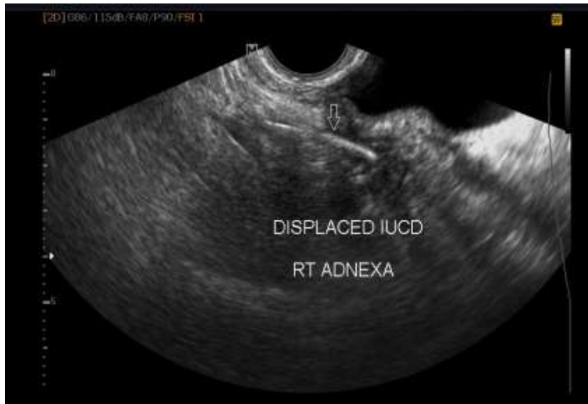
Figure 3.0: Transvaginal image showing an echogenic linear structure at the right adnexa suspected to be IUCD (White arrow)