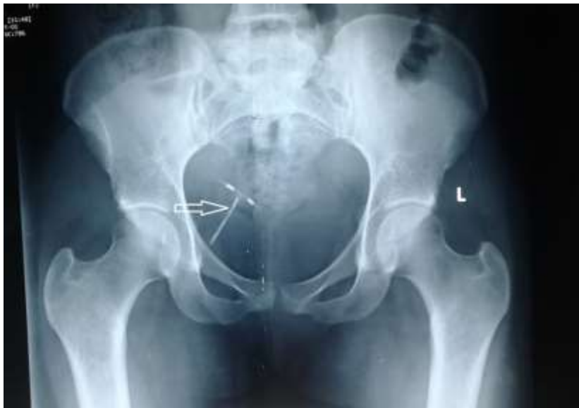
Figure 1: Showing right deviation of IUCD (white arrow) in the pelvis on x –ray