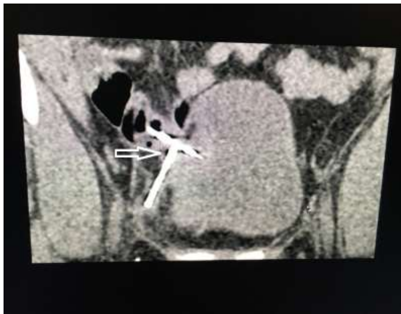
Figure 4.0: Showing CT image of simultaneous perforation of small bowel and right lateral urinary bladder wall (white arrow)

on imaging influenced the decision to perform laparotomy to remove the misplaced IUCD.