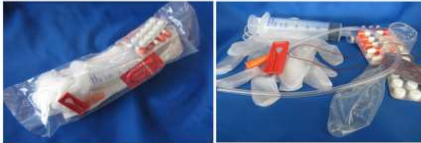
Figure 1: Intrauterine Condom Tamponade Kit and its contents